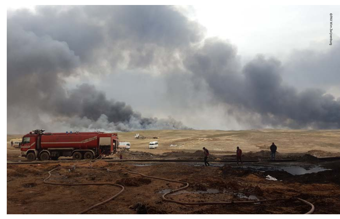
Firemen working amid the smoke caused by oil fires in Qayyarah Iraq in 2017

The 2021 PAX Protection of Civilians conference—an annual event bringing together academics, militaries, policy-makers and practitioners—focused on three themes: international support for local security actors; accountability for military missions; and PoC champions in the future of warfare.