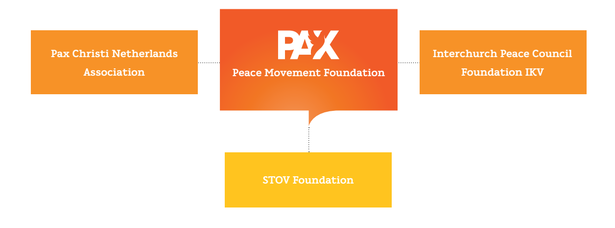
DIAGRAM OF LEGAL STRUCTURE AS AT 1 JANUARY 2022

Foundation) was founded by Pax Christi in 1997. Its role is to manage the Stiltecentrum (Silence Centre) in shopping mall Hoog Catharijne in Utrecht with the mandate of its owners, the Sisters of the Eucharist Congregation, and the PAX office on St Jacobsstraat in Utrecht. Recently, the articles of association of PAX and STOV were upgraded and STOV became a support foundation under PAX. The new articles of association entered into force on 1 January 2022.