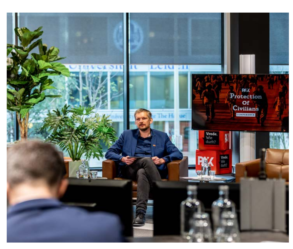
The 2021 PAX Protection of Civilians conference—an annual event bringing together academics, militaries, policy-makers and practitioners

It is encouraging that On Civilian Harm has been embraced by several universities as a gapfilling publication. Both in the Netherlands and in the United States, the book is now part of the curriculum of students who are the policy-makers and implementers of tomorrow. PAX will continue to urge both current and future leaders to be aware of the full extent of civilian harm—and use this knowledge to better protect the millions who have the bad luck of living in conflict-affected areas.