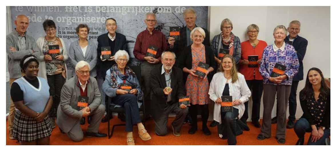
A few members of the PAX Club of 100

As a peace movement rooted in Dutch society, PAX has intensive contact with its supporters and we facilitated Peace Embassies throughout the country in 2021. Our embassies usually organise hundreds of activities per year that involve thousands of citizens. Of course, there were fewer activities in 2021 because of COVID. PAX's employees, the Board of Directors and members of the Supervisory Board regularly attend events such as the Peace Ambassadors' day and PAX's main annual event, the Peace Week. We maintain contact with our supporters (and donors) through the PAX magazine, which is published four times a year, and with interested parties via newsletters, social media and the website. In addition, we involve groups such as artists and students in the development of our campaigns. There was a sharp rise in the use of online communication in 2021. We involved people through webinars, podcasts and the online livestreaming of events.